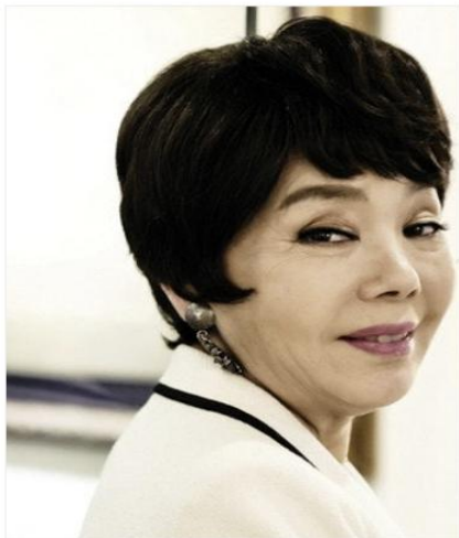
배우 김수미, 다이아몬드로 기억되다

한국 연극과 방송계를 대표하는 배우 윤석화가 새로운 개념의 기억 보존 플랫폼 '기억문화관'을 통해 상징적 의미의 '영원한 존재'로 재해석되고 있다.