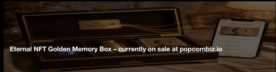
Eternal NFT Golden Memory Box – currently on sale at popcornbiz.io

All transactions on popcornbiz.io · On-chain title · Permanent record