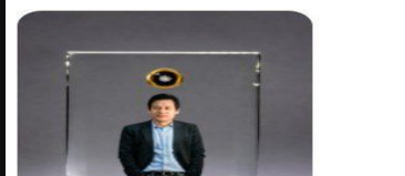
Star Forever · Artist Memorials 15+ signed Korean celebrities