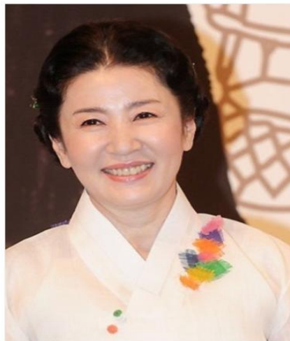
기억문화관, AI 기술 활용한 '고(故) 김자옥 디지털 아카이브' 구현

대한민국 대중문화사에 깊은 발자취를 남긴 배우 김수미가 이제 기억문화관에서 새로운 방식으로 영원히 기억된다.