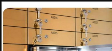
Vault-grade Bio-Gem Custody Serial-numbered · Physical security