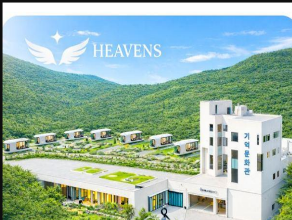
HEAVENS Memorial Center · Asan South Chungcheong, Korea · Flagship facility

Not concept, not roadshow — POPCORN already operates verifiable physical assets, live facilities, and on-chain certified digital assets.