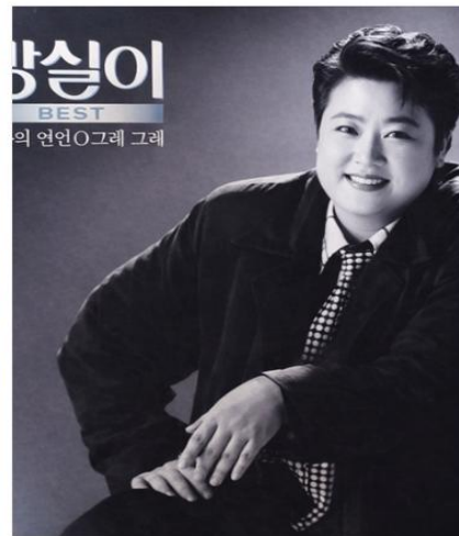
대한민국 대표 가수 방실이, 기억의 문화관으로 기억되다

기억문화관이 인공지능(AI) 기술을 활용해 배우 김자옥의 생전 모습과 감성을 재현한 디지털 아카이브를 구축했다고 밝혔다.